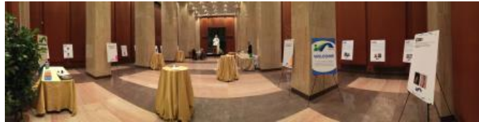
View of Madison Hall, Library of Congress

Thank you to all who attended the 2016 Conference and Celebration of the 50th Anniversary of the Journal of Consumer Affairs !